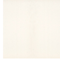
Creamy - 04